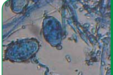
Powdery mildew hypha hyperparasitised by Ampelomyces quisqualis. Infection hyphae (stained blue) can be seen growing inside the larger hypha of Podosphaera aphanis.

Ampelomyces quisqualis is a hyper parasite of a wide range of powdery mildew fungi which penetrate the hyphal wall of a host cell and grows inside causing degradation of the cytoplasm. The rate of development within the host can be slow (5-7 days), so multiple applications of AQ10<sup>®</sup> are recommended to generate multiple infection points on the developing pathogen colony. The hyper parasitic activity leads to the collapse of hyphal strands and death. In order to demonstrate the effects of Ampelomyces quisqualis against powdery mildew (Podosphaera aphanis), preinfected detached strawberry leaves (cv. Elsanta) were sprayed with AQ10<sup>®</sup> or water (control). The leaves were collected from a commercial glasshouse strawberry crop in early April at first signs of the powdery mildew outbreak which ensured that colonies were fresh and actively growing. In the AQ10® treated leaves, microscopic assessments identified areas of mycelium which had completely collapsed and these areas were completely devoid of conidia.