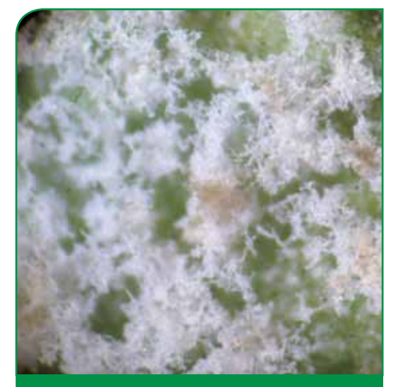
White powdery mildew growth of Sphaerotheca fuliginea on a cucumber leaf which is partially hyperparasitised with Ampelomyces quisqualis (discoloured areas).

AQ10<sup>®</sup> is safe to all beneficial insects and mites and bees used for pollination